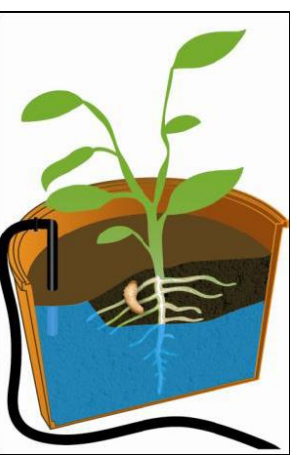
Figure 1) Optimal positioning of dripper close to the base of blueberry plant. Figure 2) Undesirable positioning of dripper far from base of blueberry plant.

Water released from a dripper spreads down and sideways through media. Horizontal spread of nematodes can be improved by repeated short bursts of irrigation or by applying the nematodes to already wet soil. Positioning the drippers close to the base of the plant and also encouraging horizontal spread of irrigation water will give better control. This is especially important in blueberries where the BVW larvae girdle the stem of the plant just below the soil surface.